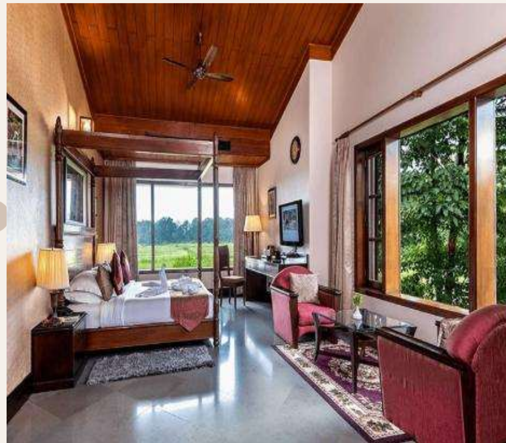
Partner – Aahana Resort