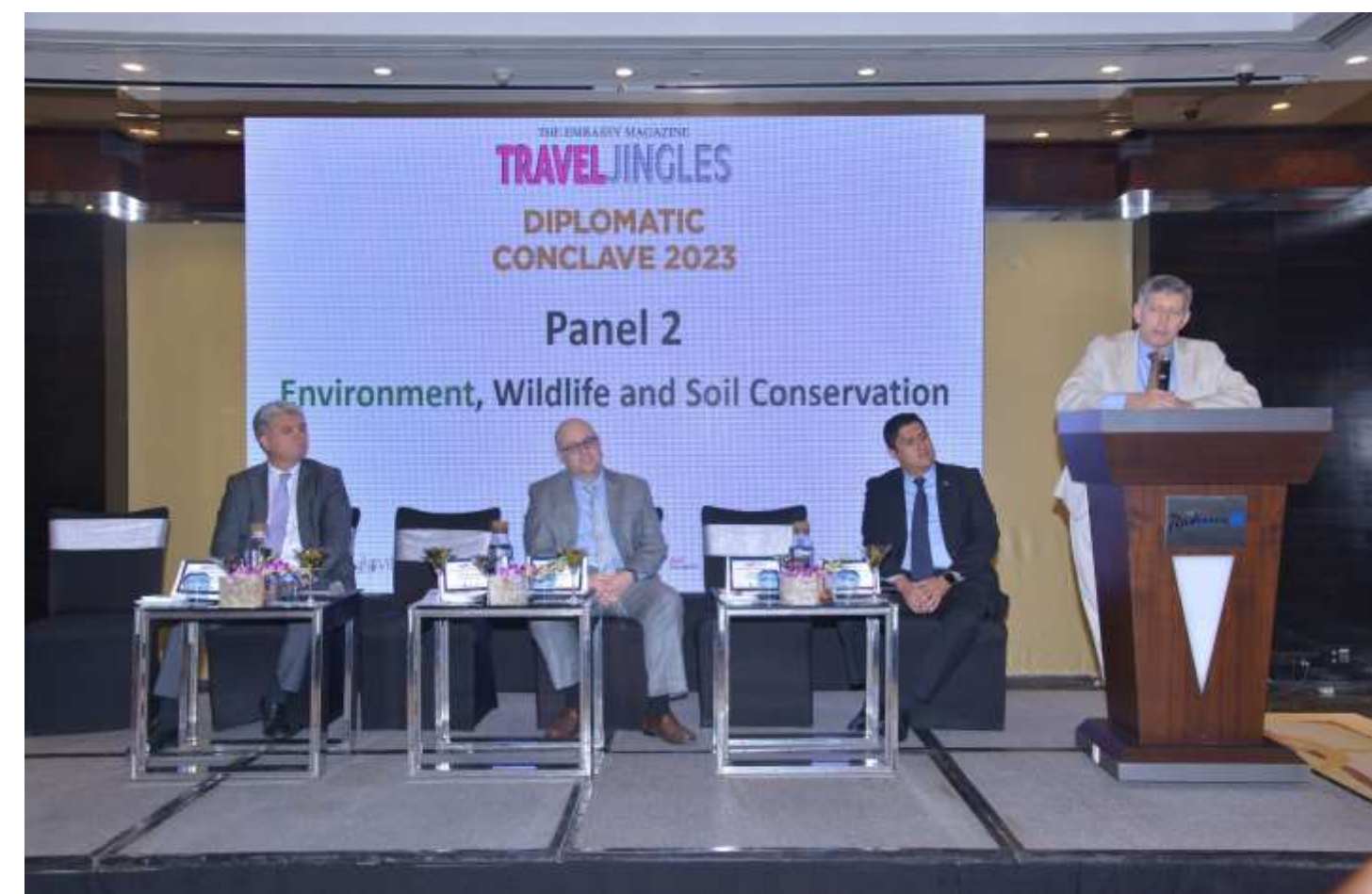
L-H- Ambassador of Uruguay, High Commissioner of Malta, Economic Counsellor of El Salvador & Ambassador of Ecuador.