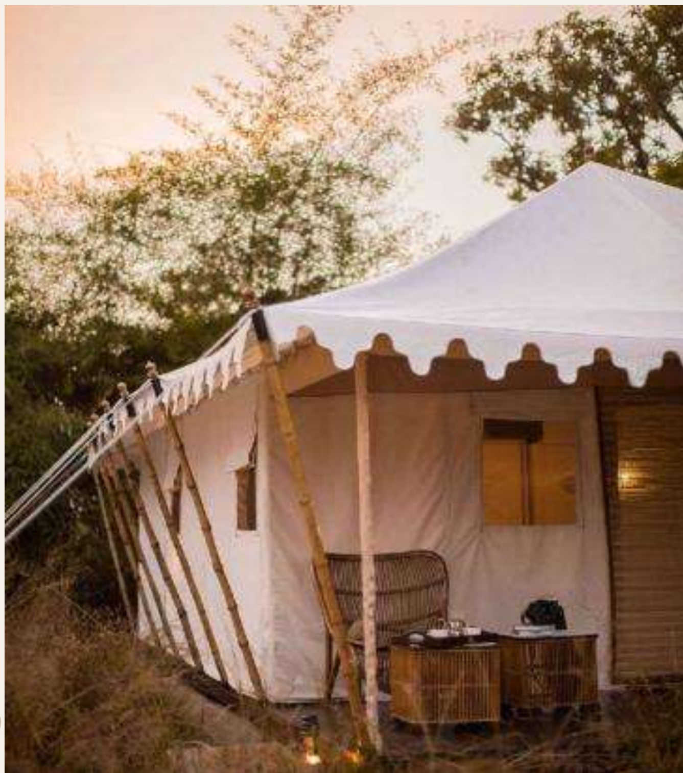
Partner – Bagh Villas