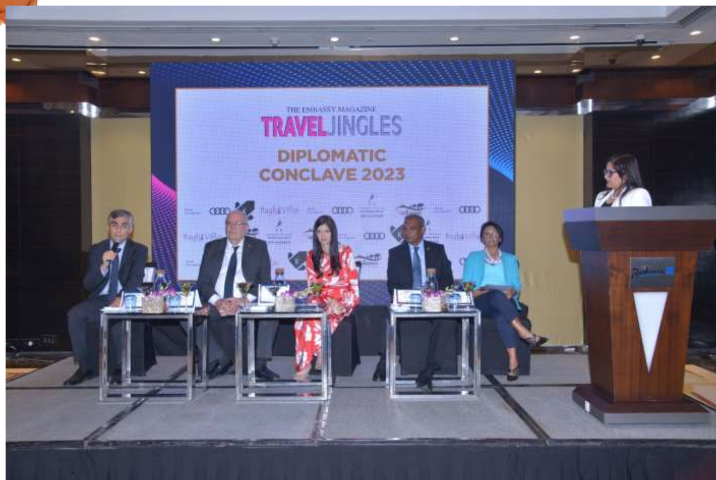
L-H-Ambassadors of Chile, Uruguay, and Panama. High Commissioners of Maldives & Seychelles respectively.